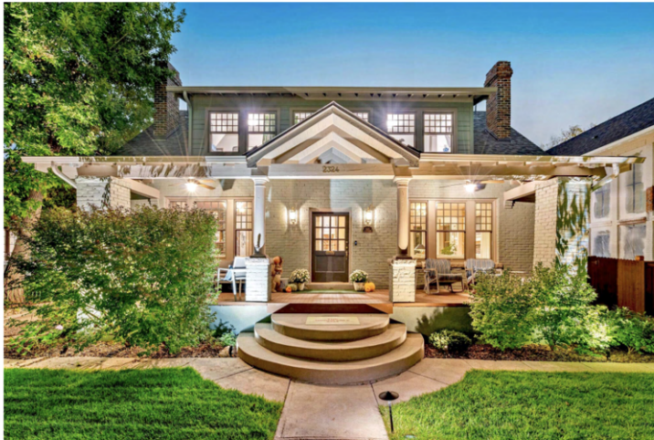
A home for sale in Observatory Park in Denver