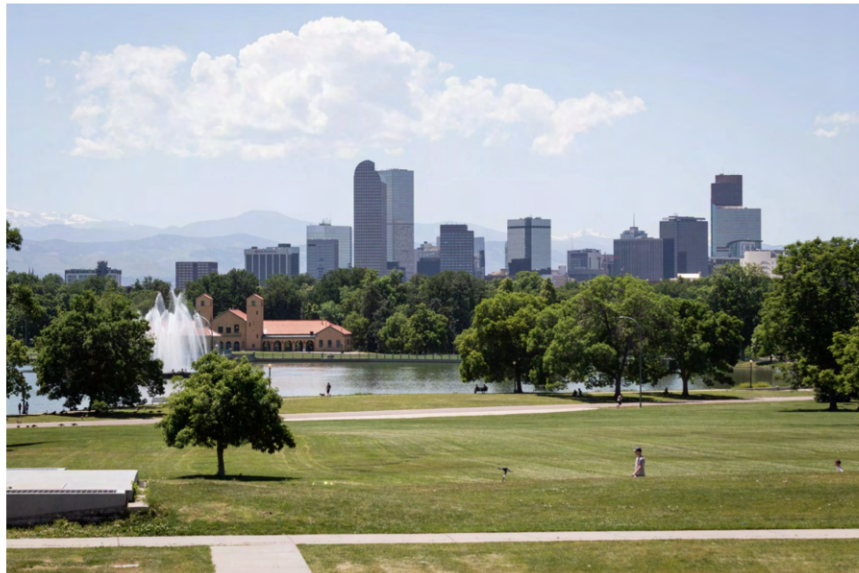
Denver's real estate market is cooling off. Jack Spiegel